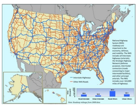
Figure 2 The increase of Black asphalt roads all over the world. Here displayed in the U.S.