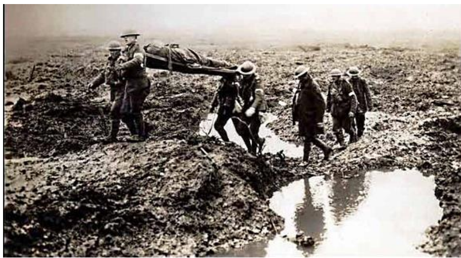
First World War (1914 - 1918), The Western Front

Hilbert immediately started writing down a formula which is nowadays known as Einstein's field equation. Hilbert quickly solved the problem Einstein had been struggling with for many years. It was the basic equation of the general theory of relativity. Einstein left Göttingen both angry and contempt. He was angry as he had been treated harshly and condescendingly, but was also happy because he finally had his equation. It was worth visiting Hilbert and the humiliation was not in vein. Thanks to that, he could finish his new theory, which would be later on called the General Theory of Relativity (GTR). However, Hilbert, after drawing proper conclusions from the experience, did not want to give Einstein the results of his works on a golden platter.