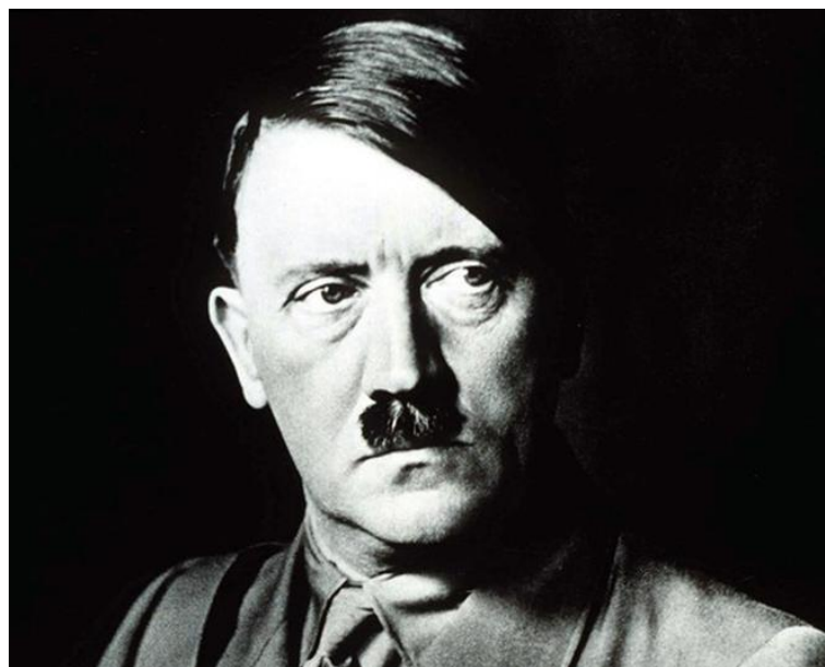
Adolf Hitler (1889 - 1945)

were dropped on German cities and industrial centers, both during the day and at the nighttime. It should not be surprising that with all the discussed events happening, with all the murders and fights, the death of an old German professor from Göttingen went completely unnoticed. However, Albert Einstein, living in a calm and safe neighborhood in Princeton, USA, made a note of it. What did he feel then? It was possibly relief. His great nemesis finally passed away. At first, there had been Herman Minkowski, then Henri Poincaré, and afterwards David Hilbert – with the last one being also the most dangerous one. Einstein finally felt safe and free. After Adolf Hitler becoming chancellor in Germany, Albert Einstein, together with his wife, assistant, and secretary, moved to the USA for good, leaving Germany behind.