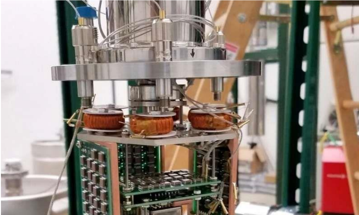
A low-mass dark matter experiment is set up at UC Berkeley.

The report proposes a focus on small-scale experiments—with project costs ranging from $2 million to $15 million—to search for dark matter particles that have a mass smaller than a proton. Protons are subatomic particles within every atomic nucleus that each weigh about 1,850 times more than an electron.