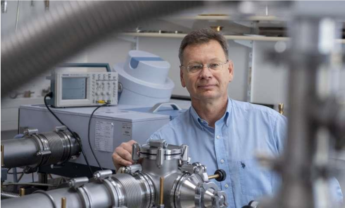
The physicist in his lab at the Dresden High Magnetic Field Laboratory of the HZDR (Germany).

increased the pressure to around two gigapascals—a pressure similar to the one exerted by the weight of a car on a surface the size of a colored pencil lead.