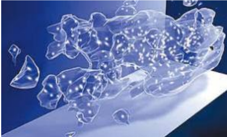
Fig.3 Image of dark matter and the galaxy [5]

White spots are galaxies and clear jellies are dark matters.