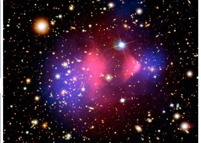
Fig.4 Bullet Galaxy