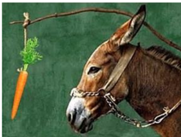
Fig. 10, p. 11 in CEN.pdf

If you are not interested in Mathematics and theoretical physics, and are only curious about the basic principle of the physics of life, check out p. 4 and the continuum on p. 39 in the “manual”. The quantum-gravitational, atemporal , and pre-geometric Res potentia springs “within” every geometric point/event, that is, “between” photon’s emission and absorption (Kevin Brown). Its duration, recorded with a physical clock, is zero – read the Greek story on p. 31 therein . In the so-called Arrow of Space (p. 7), time comes from both ‘change in space’ (the coordinate time, recorded with clocks) and ‘change of space’. The latter is completely nullified, being “inside” every geometric point/event. Hence we have perfect (Sic!) spacetime continuum in the light cone , whereas the Platonic Res potentia is shifted to the potential future (see the carrot below). It is accessible only to the living and quantum-gravitational world (p. 7). All you need is a brain . You don’t have to learn exotic techniques like meditating on a rock or solving differential equations : spacetime engineering works like a black box (p. 43; see also Slide 14 ).