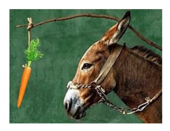
Fig. 10, p. 11 in CEN.pdf You only have to swing the carrot (potential future) toward your desired destination, and the donkey will carry you and the cart there.

If you are not interested in Mathematics and theoretical physics, and are only curious about the basic principle of the physics of life, check out p. 4 and the continuum on p. 39 in the "manual". The quantum-gravitational, atemporal , and pre-geometric Res potentia springs "within" every geometric point/event, that is, "between" photon's emission and absorption (Kevin Brown). Its duration, recorded with a physical clock, is zero — read the Greek story on p. 31 therein. In the so-called Arrow of Space (p. 7), time comes from both 'change in space' (the coordinate time, recorded with clocks) and 'change of space'. The latter is completely nullified, being "inside" every geometric point/event. Hence we have perfect (Sic!) spacetime continuum in the light cone, whereas the Platonic Res potentia is shifted to the potential future (see the carrot below). It is accessible only to the living and quantum-gravitational world (p. 7). All you need is a brain. You don't have to learn exotic techniques like meditating on a rock or solving differential equations: spacetime engineering works like a black box (p. 43; see also Slide 14).