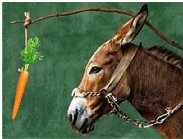
Fig. 10, p. 11 in CEN.pdf

If you are not interested in Mathematics and theoretical physics, and are only curious about the basic principle of the physics of life, check out p. 4 and the continuum on p. 39 in the “manual”. The quantum-gravitational, atemporal , and pre-geometric Res potentia springs “within” every geometric point/event, that is, “between” photon’s emission and absorption (Kevin Brown). Its duration, recorded with a physical clock, is zero – read the Greek story on p. 31 therein . In the so-called Arrow of Space, ‘time’ comes from both ‘change in space’ (the coordinate time, recorded with clocks) and ‘change of space’. The latter is completely nullified, being “inside” every geometric point/event. Hence we have perfect (Sic!) spacetime continuum in the light cone , whereas the Platonic Res potentia is shifted to the potential future (see the carrot below). It is accessible only to the living and quantum-gravitational world (p. 7). All you need is a brain . You don’t have to learn exotic techniques like meditating on a rock or solving differential equations : spacetime engineering works like a black box (p. 43; see also Slide 14 ).