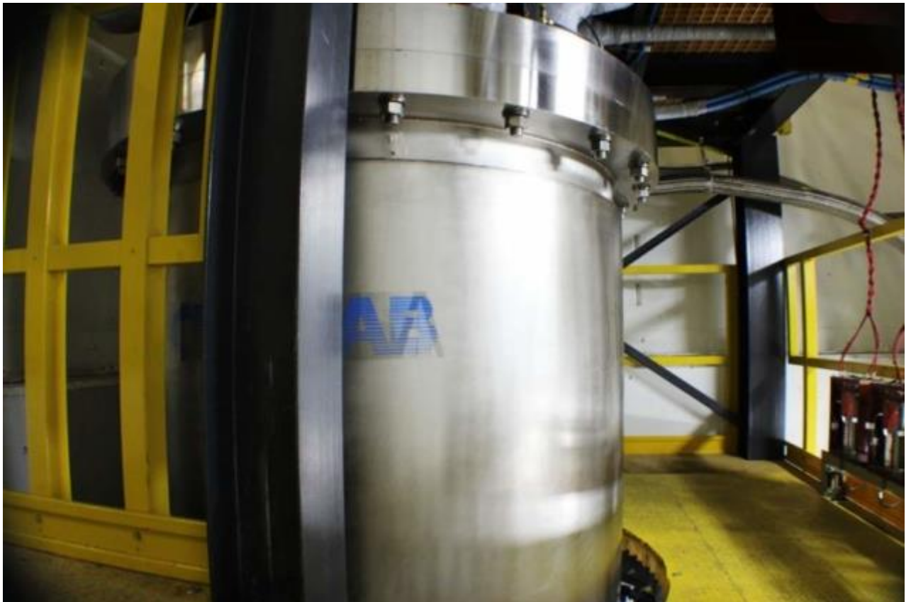
According to Shekhter, the 100 T magnet at Los Alamos National Laboratory in the US was the “real hero” of the work.

In this new research, Shekhter – a co-author of the 2016 study – worked with colleagues in the US, Columbia and Germany to ascertain whether the same “B-linear resistivity” was also seen in cuprates. They tested the resistance of thin films of strontium-doped lathanum cuprate, finding it was linearly proportional to magnetic field across a wide range of temperatures at fields up to 80 teslas – the highest they tested. Shekhter says that these results provide crucial confirmation that strange metals cannot be described by Fermi-liquid theory.