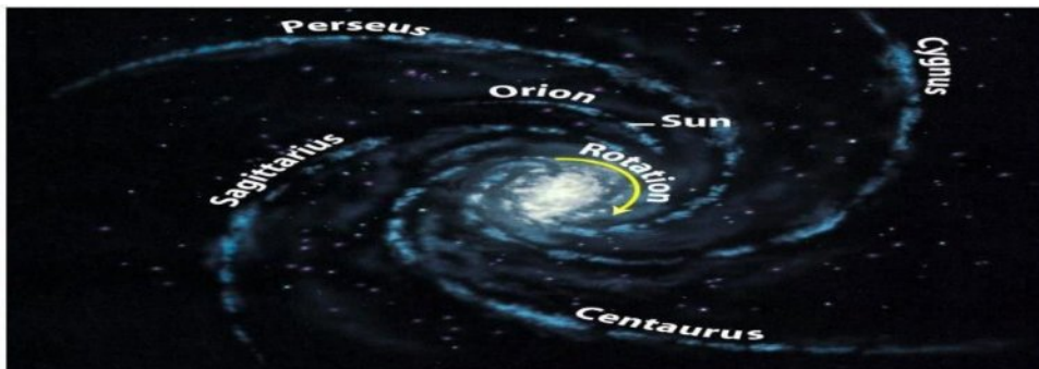
Figure 5 THE SUN IN THE MILKY WAY

In these pictures, THE SPIRAL UNIVERSE shows why Andromeda moves towards us and Red shift shown from distant galaxies and why accelerating at distant horizon. There is Gravitational coordination in this spiral Universe model and important aspect is that our universe works under Gravitational unity. Our galaxy and Our Universe and Our solar system work same gravitational principle.