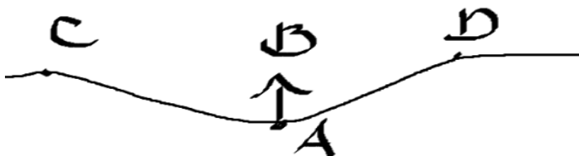
Figure 2 the movements in curvature of space time after the sun disappear

WHEN SUN DISAPPEAR, what happened really in relativity: