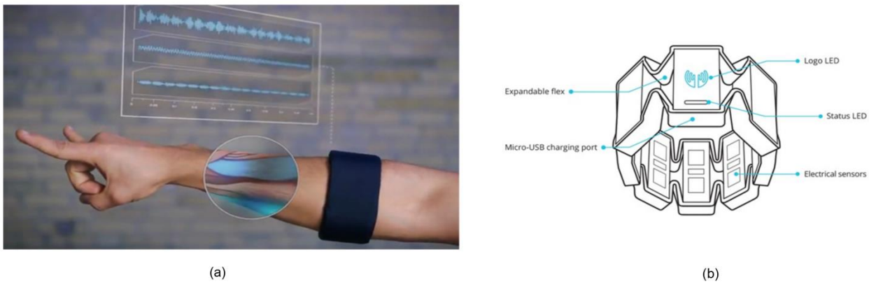
Figure 2. (a) MYO Armband reading electrical signals from muscles. Source: MYO. (b) Structure of MYO Armband. Source: MYO.

armband similarly detects when it has been removed from the arm. An application can provide feedback to the wearer of the MYO armband by issuing a vibration command. This causes the MYO armband to vibrate in a way that is both audible and sensed through touch.