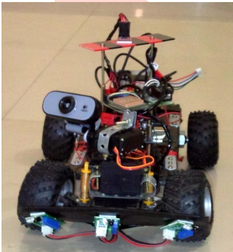
Figure 6. Gesture Controlled Robot [9, 10]

Result 2: We measured usability in terms of satisfaction metrics for using MYO armband (hand gesture navigation) to control Apple Maps and various other applications [11, 12]. A simple and widely used System Usability Scale (SUS) questionnaire model was implemented to suggest some guidelines about the use of MYO armband. The user-feedback and observations found during our testing have led us to offer some practical insights to designers and developers on how the prototype software can be extended.