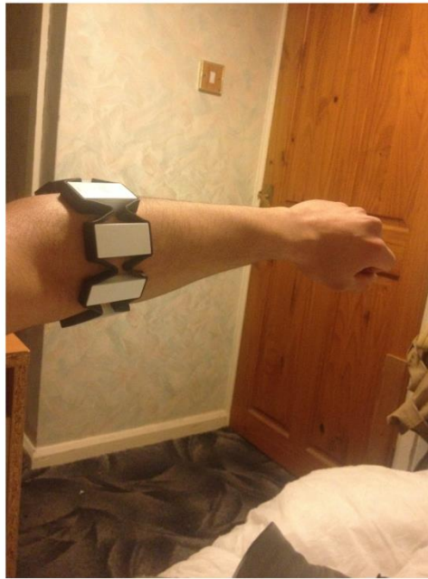
Figure 1. MYO Armband

The figure 2(b) gives you a glimpse of the physical structure of the MYO. The eight segments of expandable casing enclose the MYO armband's components and are connected using stretchable material that allows them to expand and contract relative to each other, so that the MYO armband can comfortably fit each user's unique physiology. The electrical sensors measure electrical signals travelling across the user's arm, which the MYO armband translates into poses and gestures. The USB charging port allows you to charge the MYO armband's internal battery using a USB power adapter or a conventional USB port on a computer. The logo LED shows the sync state of the MYO armband. It pulses when the MYO armband is not synced. The LED becomes solid when you perform the Sync Gesture successfully and the MYO armband is synced to your arm. The status LED shows the current state of the MYO armband. It lights up in blue once the MYO armband is connected to a device. The MYO armband is connected to a device (e.g. a computer, tablet, or Smartphone) using Bluetooth 4.0 Low Energy [4].