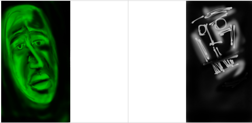
Fig. 2 Second set of hallucinations – first the long-suffering sardonic green-lit figure(left) then a series of jeering zombie faces such as those from the Pirates of the Caribbean films (right.)