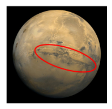
"In the 1970's the engineer Ralph Juergens first proposed that Valles Marineris is the scar left by a giant, interplanetary lightning bolt ... "

· Valles Marineris "is a system of canyons that runs ... more than 4,000 km (2,500 mi) long, 200 km (120 mi) wide and up to 7 km (23,000 ft) deep ... [and] is one of the larger canyons of the Solar system ... Valles Marineris is located along the equator of Mars ... and stretches for nearly a quarter of the planet's circumference ... It has been recently suggested that Valles Marineris is a large tectonic 'crack' ... formed as the crust thickened ... and was subsequently widened by erosion ... [S]ome channels ... may have been CO2.' formed bv H<sub>2</sub>O or (https://en.wikipedia.org/wiki/Valles Marineris, "Valles Marineris")