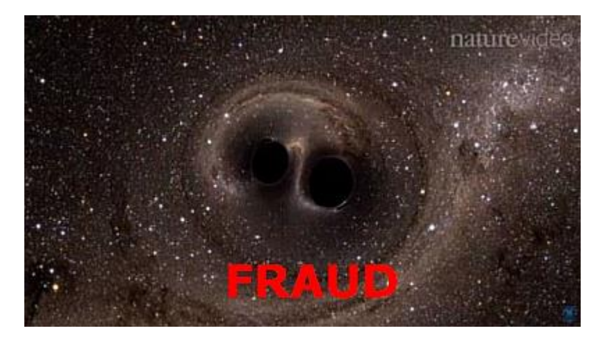
Fig. 3, adapted from D. Castelvecchi and A. Witze<sup>18</sup>

First things first. Then the "GW astronomers" can proceed further by reformulating the current geodesic equation ( \nabla_{\mu} T^{\mu\nu} \neq 0 at all geodesic points), in order to explain the "localization" of gravitational energy<sup>15</sup> and the singularity "theorems"<sup>17</sup>, or whatever is left from them, and finally announce their double discovery: "the first direct detection of gravitational waves and the first observation of a binary black hole merger."