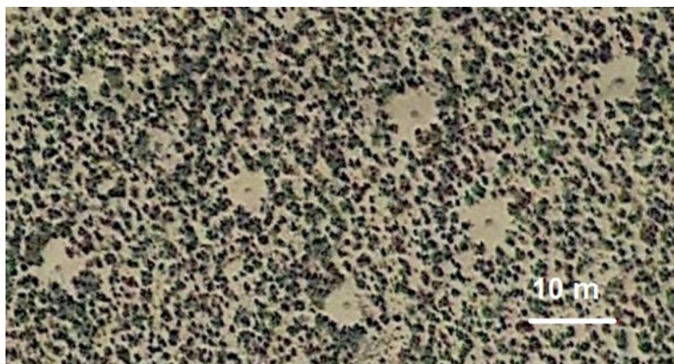
Figure 4: Discs in patterned vegetation (Courtesy Google Earth, coordinates: 36°14'55.07"