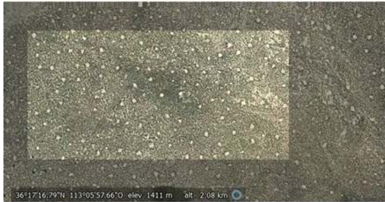
Figure 2: Patterned vegetation having a "polka-dot" arrangement (coordinates: 36°17'16.79" N, 113° 05' 57.66" W). A part of the image has contrast and brightness enhanced.

In the Figure 1, the markers are showing a large area, near the Grand Canyon rim, where, using Google Earth, we can see a patterned vegetation like that given in the Figure 2. The patterned vegetation has a "polka-dot" arrangement of discs. In the following Figure 3 and 4, the pattern is given in images with smaller scales.