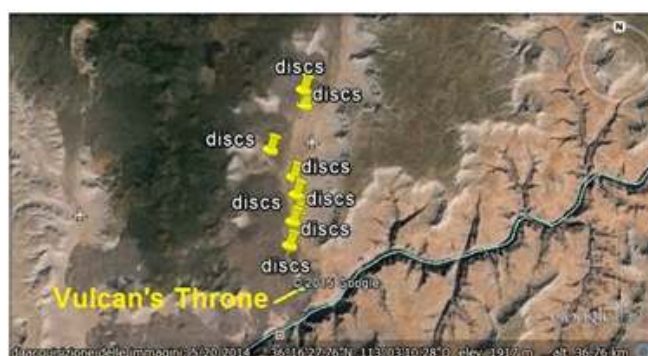
Figure 1: The markers show a large area, 10 km long, near the Grand Canyon, where it is possible to observe a patterned vegetation, like that given in the following Figure 2.

Reference 9 is fundamental to understand the patterned vegetation that we can find in another area of Arizona. It is near the Vulcan's Throne, a cinder cone volcano and a prominent landmark on the North Rim of the Grand Canyon. This area is not reported in [9], probably because in 2008 the satellite images had a low resolution. Today, using Google Earth for the areas marked in the map shown in the Figure 1, we can see a large landscape covered by discs, that look like those shown in Ref.9. For this reason, we are here proposing that these discs are nest discs of ant colonies. The number of these discs, disseminated in a valley 10 km long is impressive.