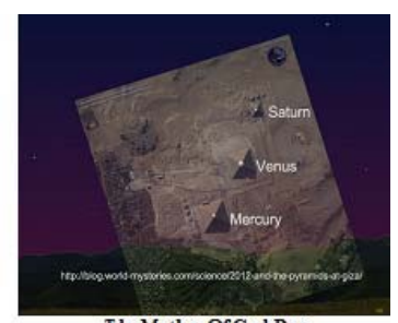
The Mother Of God Day 29 January 2015 Written in Cairo – Egypt

2<sup>nd</sup> -To explain Why for each Cycle Period in the Solar system, there's an identical distance? and How can we define a specific distance for specific Cycle?