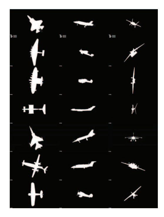
Fig. 3: Poses of different types of aircrafts.

93.5% of success with the PCR5-based SMF-ATR. In term of computational time, it takes between 5ms and 6ms to process each image in the sequence with no particular optimization of our simulation code, which indicates that this SMF-ATR approach is close to meet the requirement for real-time aircraft recognition. It can be observed that PCR5-based SMF-ATR outperforms DS-based SMF-ATR for 3 types of aircraft and gives similar recognition rate as with DS-based SMF-ATR for other types. So PCR5-based SMF-ATR is globally better than DS-based SMF-ATR for our application.