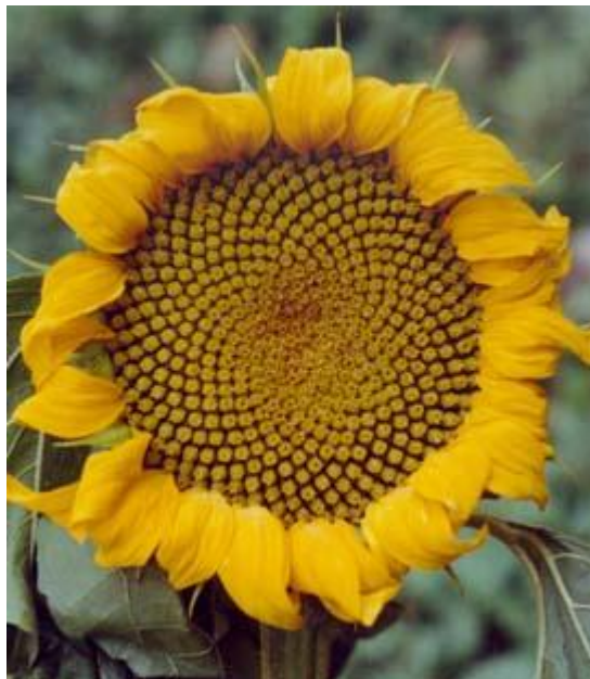
Image2: Sunflower (photo by Yves Couder). The numbers and arrangements of petals, leaves, sections and seeds in most plants are Fibonacci numbers. The sunflower in the picture has 55 petals spiral