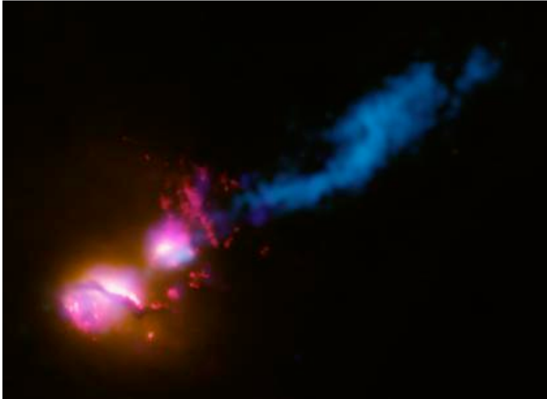
Figure 1. "Death Star Galaxy" (3c321), Credit: X-ray: NASA/CXC/CfA/D.Evans et al.; Optical/UV: NASA/STScI; Radio: NSF/VLA/CfA/D.Evans et al., STFC/JBO