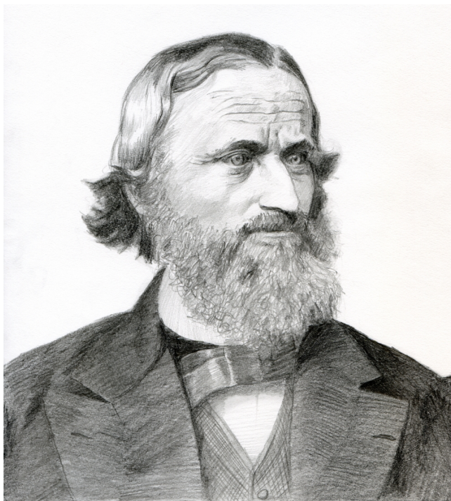
Gustav Robert Kirchhoff (12 March 1824 – 17 October 1887)