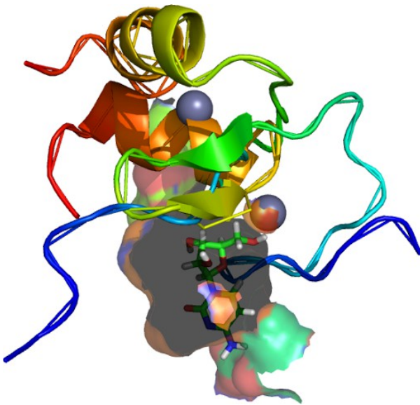
Figure 3: This incorporates PDB 1Y0J_A_B the Structural basis of GATA1_A erythroid transcription factor and FOG1_B Zinc finger Protein (MMDB ID: 31470; Mus musculus A- Drosophila melanogaster-B) interactions with Human components of Complexed With a molecule biological unit ara-C (Arabinofuranosylcytosine) Cytarabine (CID_6253; SDF File (.sdf) = ara-c (MMDB ID: 23600 PDB ID: 1P5Z) short (sf) and (lf) long forms 2 'finger' motifs of GATA 1 (lf) and FOG (sf) with (FKBP12) basal expression PDB 2FAP_component A represented as the ligand surface partially framing the FOG heterodimer prevents formation of DNA component PDB: 1GAT-cDNA when lacking basal expression. This apparatus appears to interact with an HS2 region mutated in its GATA motif.