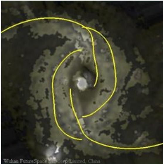
Figure 3: The yellow curves are the examples of Darwin curves calculated with Galaxy Anatomy graphic software (version 2).