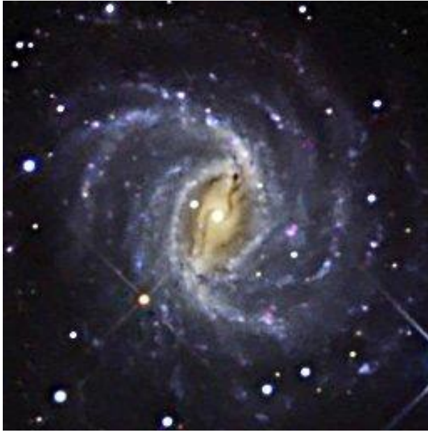
Figure 1: Image of galaxy NGC 5921 with optical light (shorter-wavelength radiation).

distribution is comparable to the stellar distribution of the galaxy. This can be described by a function of x and y on the galaxy disk plane,