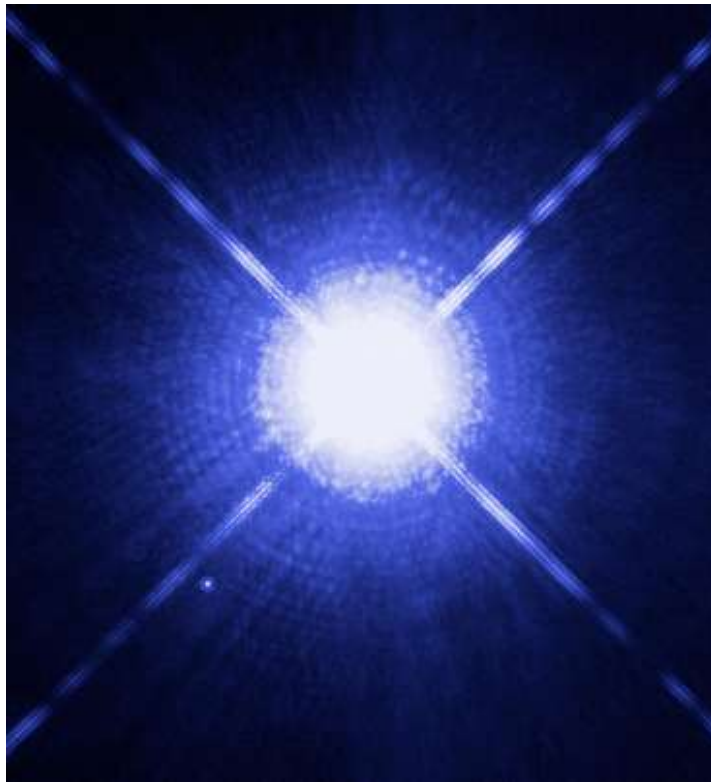
This image of Sirius A and Sirius B was taken Oct. 15, 2003, with Hubble's Wide Field Planetary Camera 2.

The white dwarf Sirius B provides a unique case study for safety procurement discussions which concern an analysis of white dwarfs or neutron stars – in that it is proximate to our local surrounding in space - just a few light years away. The following image of Sirius B with its parent star Sirius A herein as captured via Hubble: