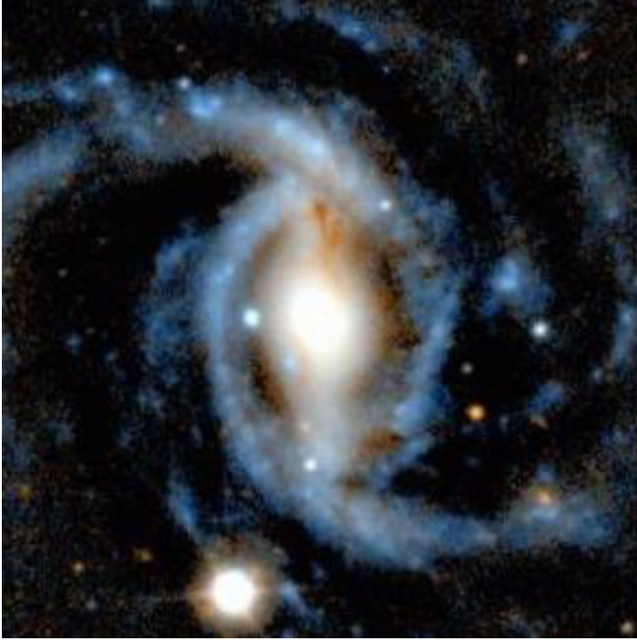
Figure 2: An image of barred spiral galaxy NGC 5921. The galaxy presents two grand-design arms.

where b_1, b_2 are constant parameters, r is the polar radius, and