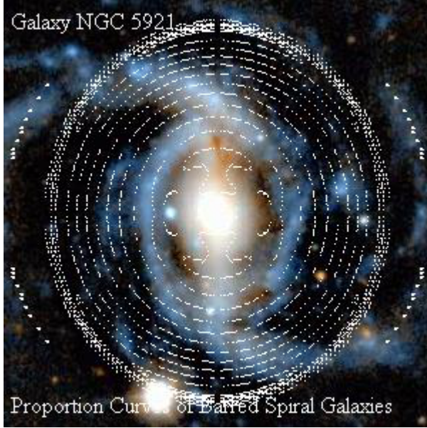
Figure 4: The image of barred spiral galaxy NGC 5921 as shown on Figure 2. The spider-shaped proportion curves do trace or cut through arms consistently as in the case of normal spiral galaxies (see Figure 1).

spiral galaxies could be expressed with simple functions too. The calculation of the azimuthal angle \alpha for the tangential lines of proportion curves involves the third derivatives of f(x, y) while the calculation of the rational orthogonal conditions involves the fourth derivatives. Without further theoretical analysis and appropriate computing technique, the direct numerical calculation with common computers may present significant errors. Fortunately, the error can be greatly reduced by the choice of larger scale s in the formula (7). The choice of the scale in Table 1 (the third column) indicates that the left sides of the orthogonal conditions (13) and (15) (i.e., P(x, y) and G(x, y) ) are significantly small in the relevant areas for the galaxy NGC 5921. That is, the absolute values of these quantities are generally less than 10^{-16} . This suggests that the galaxy is rational. Detailed calculation indicates that there are a few lined areas where the discriminant of the quadratic equation (11) is negative. This means that the galaxy must be at the ground state in the relevant areas. In all other areas, the absolute values of M(x, y) are much smaller than the ones of the quantities P(x, y) and G(x, y) . It means that the galaxy is generally at the excited minus state.