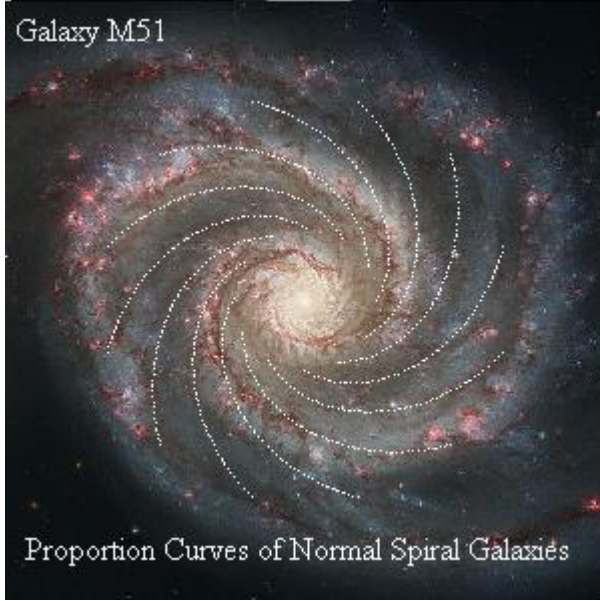
Figure 1: The shorter-wavelength image of normal spiral galaxy M51. The arms follow equiangular spirals which are the proportion curves of exponential disk.

Now that the origin of arms for normal spiral galaxies is explained, I go further to study barred spiral galaxies (see paper [5]). Are barred spiral galaxies rational? If they are, what do the corresponding proportion curves look like? In Section 2, I answer the first question. Section 3 is dedicated to the explanation of the second question. Section 4 is the conclusion.