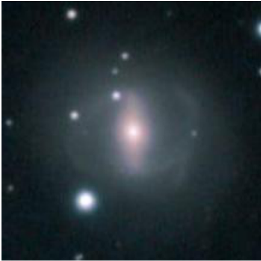
Figure 2: An image of barred spiral galaxy NGC 4665. The galaxy presents two grand-design arms.

where b_1, b_2 are constant parameters, r is the polar radius, and