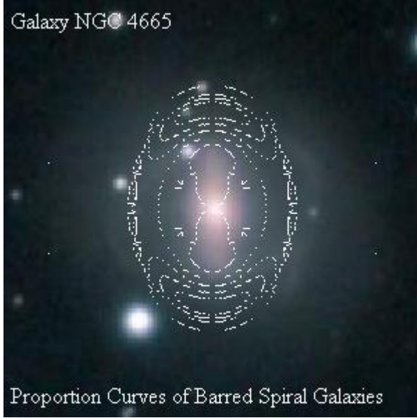
Figure 4: The image of barred spiral galaxy NGC 4665 as shown on Figure 2. The spider-shaped proportion curves do trace or cut through arms consistently as in the case of normal spiral galaxies (see Figure 1).

spiral galaxies could be expressed with simple functions too. The calculation of the azimuthal angle \alpha for the tangential lines of proportion curves involves the third derivatives of f(x, y) while the calculation of the rational orthogonal conditions involves the fourth derivatives. Without further theoretical analysis and appropriate computing technique, the direct numerical calculation with common computers may present significant errors. Fortunately, the error can be greatly reduced by the choice of larger scale s in the formula (7). The choice of the scale in Table 1 (the third column) indicates that the left sides of the orthogonal conditions (13) and (15) (i.e., P(x, y) and G(x, y) ) are significantly small in the relevant areas for the galaxy NGC 4665. That is, the absolute values of these quantities are generally less than 10^{-16} . This suggests that the galaxy is rational. Detailed calculation indicates that there are a few lined areas where the discriminant of the quadratic equation (11) is negative. This means that the galaxy must be at the ground state in the relevant areas. In all other areas, the absolute values of P(x, y) are much smaller than the ones of the quantities M(x, y) and G(x, y) . It means that the galaxy is generally at the excited plus state.