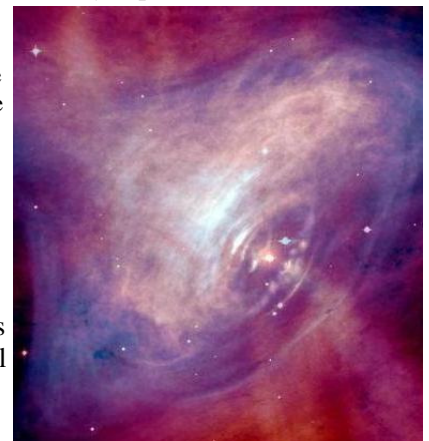
FIG. 4. Toroid black holes are scalable. Centre of the Crab Nebula I.R. note the weak gas jet. The Tokamak form has intrinsic rotation and helical fields and jet vectors.

The ions themselves represent the inertial mass needed for the full equivalence of gravitational mass