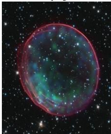
FIG. 2. The expanding Plasma Bubble in the Large Magellanic Cloud; NASA, ESA, Hughes.

The QED analogy of the DFM is absorbed photons re-emitted at 'c' in the rest frame of the co-moving electron. This has an effect well known in optics [1] where the time averaged Poynting vector can be reversed, but this is mistakenly little recognised and applied in general physics due to the extra variable. The velocity change is twofold ; first due to the index 'n' of the medium, giving c/n, and second due to the relative 'v' (inertial frame) between media in relative motion. Only the acceleration energy requires remains as described by the Lorentz/ Fresnel exponential transformation function. (LT). We give an example; Consider a plasma bubble or cloud expanding in a vacuum. FIG. 2 shows the Magellanic cloud white dwarf supernova bubble, 23 light years dia. expanding at 18m km/hr. Let the plasma layer be 1,000km thick with n = 1.1. To an observer O at rest with the centre point of the sphere a light pulse entering the membrane would appear to slow by 18m.km/hr.(v p ) plus the c/n of the local plasma. Light reaching O is only the EM waves emitted by each one of a progression of particles, the scattered signal from each one travelling at 'c', but the sequence will give an apparent c^1 = c/n + v_p . This is entirely allowable without breaching either SR postulate as it is moving in a different frame/field and nothing breaches the limit 'c' in reality. Observing from a different inertial frame allows apparent. c + v .