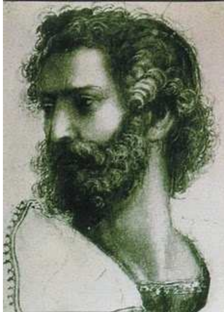
Picture: Aristotle, the nature-philosopher