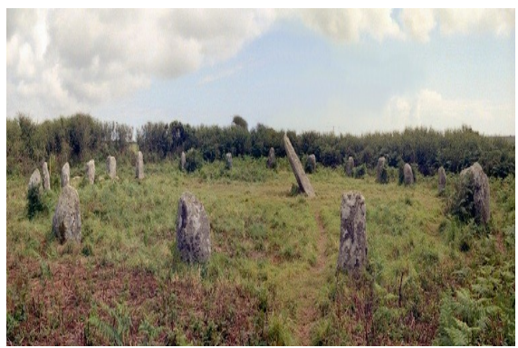
Boscawen-un Circle, Cornwall, UK

The outer bank, still very impressive, was originally 17m (55ft) high from ditch bottom to bank top. The stones, each weighing about 40 tons or more,