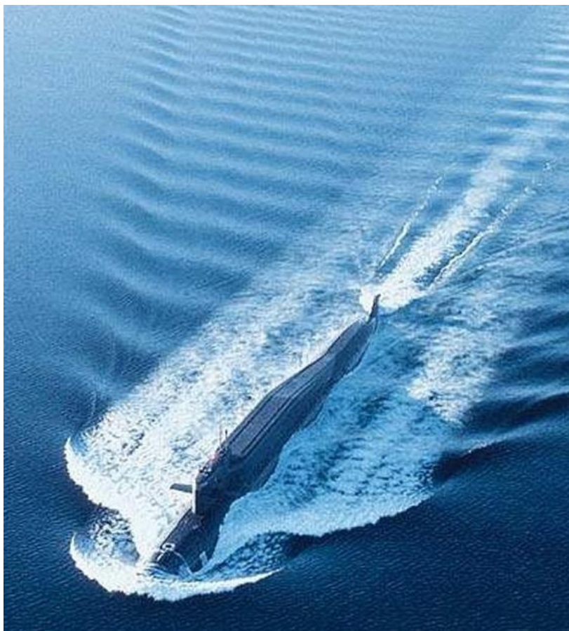
Fig.1 Wake waves on the water.

A general view of the Wake waves on the water is shown in Fig.1.