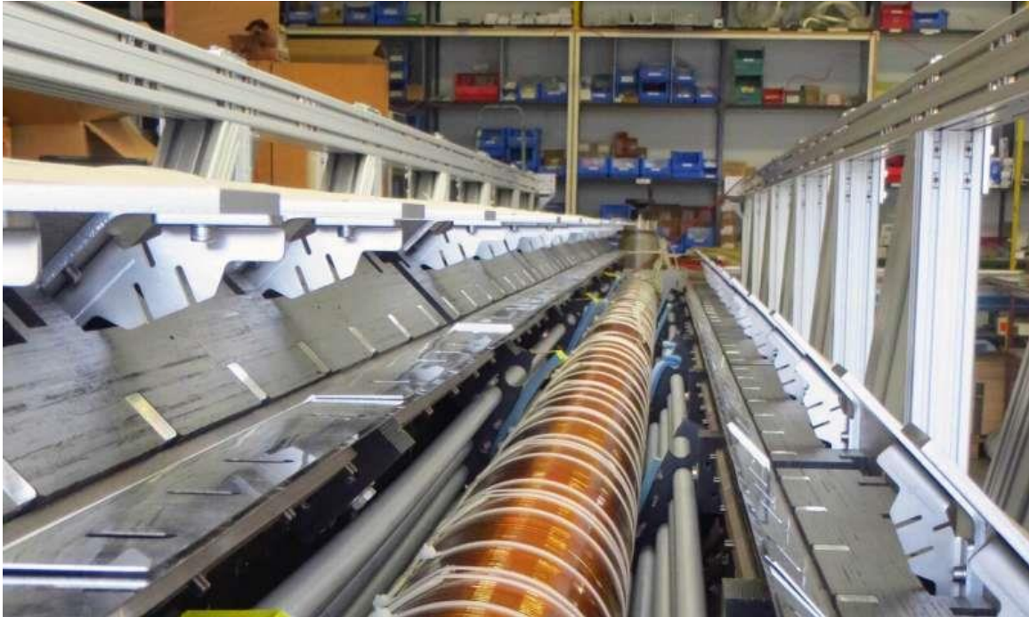
The vacuum chamber for the atomic fountain with magnetic shield.