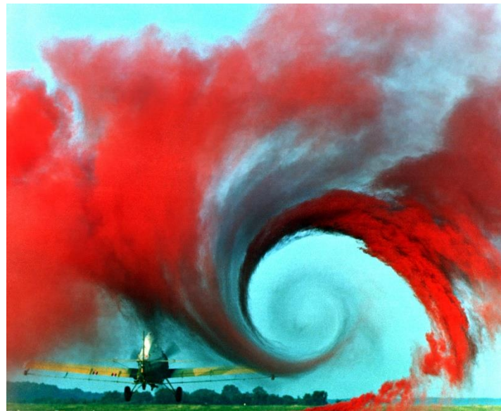
Figure 1 Turbulent flow generated by the tip vortex of the aeroplane wing shown up by red agricultural dye. (after Mae Wan-Ho, [38]).

Shadow gravity is valid in the situation of gravitational interaction between two discrete masses that divert the ambient gravitational flux-density away from each other. This