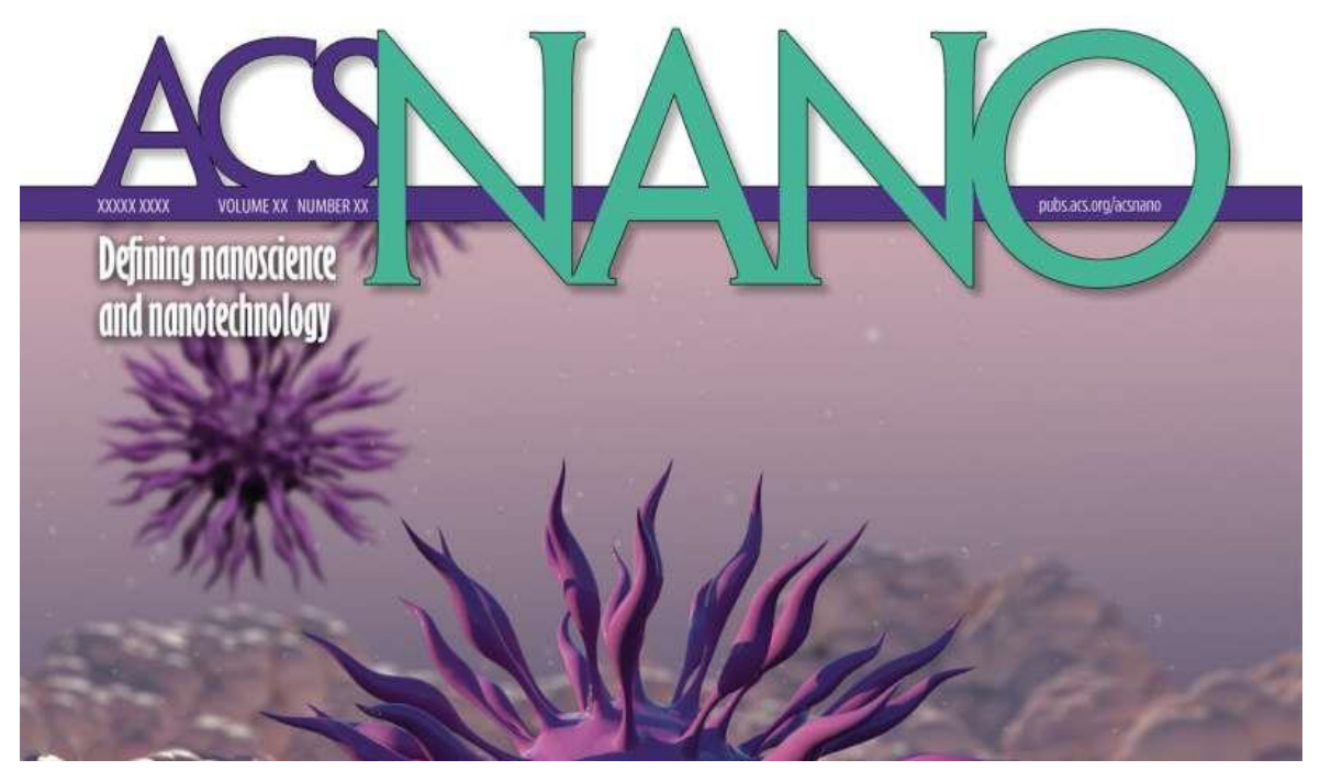
OSU researchers Olena and Oleh Taratula's work with magnetic nanoclusters as cancer therapy was featured on the cover of ACS\ Nano .