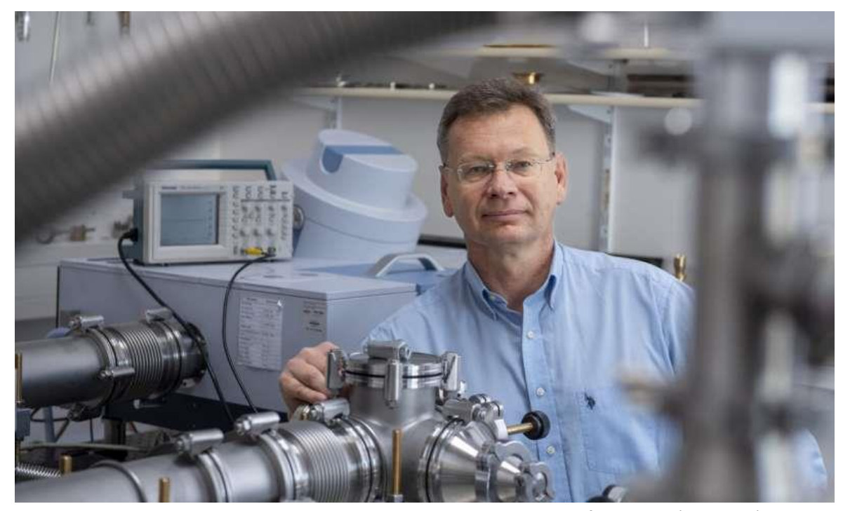
The physicist in his lab at the Dresden High Magnetic Field Laboratory of the HZDR (Germany).

increased the pressure to around two gigapascals—a pressure similar to the one exerted by the weight of a car on a surface the size of a colored pencil lead.