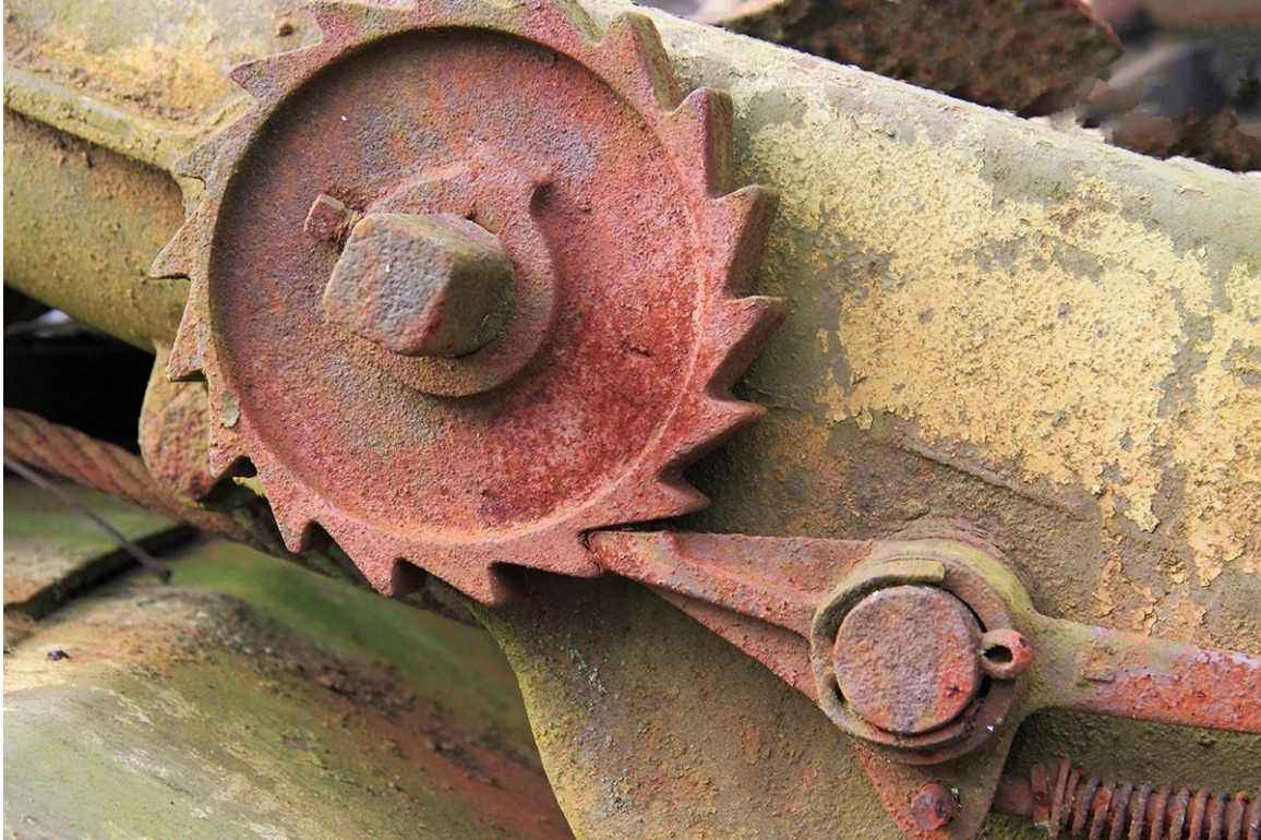
Feynman's ratchet is built at last using 19 optical tweezers

“At first, it looked like the answer to this question was negative,” explain Poem and colleagues in their report. “It was proven that internal coherence cannot lead to efficiencies higher than the Carnot limit, and the first coherence-related effect predicted for heat engines, the “quantum friction,” actually involved degradation in performance.” More recent reports have presented a more optimistic outlook, although experimental evidence of a heat engine with inherent quantum features as opposed to externally injected coherence, remained wanting.