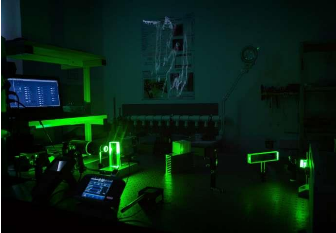
Functioning of a new laser.

Scientists from ITMO University's Research Institute of Laser Physics have developed a laser for a lunar locator capable of measuring the distance to the moon with a margin of error of a few millimeters. The laser boasts a relatively small size, low radiation divergence and a unique combination of short pulse duration, high pulse energy and high pulse repetition rate. The laser pulse duration is 64 picoseconds, which is almost 16 billion times less than one second. The laser's beam divergence, which determines radiation brightness at large distances, is close to the theoretical limit; it is several times lower than the indicators described for similar devices.