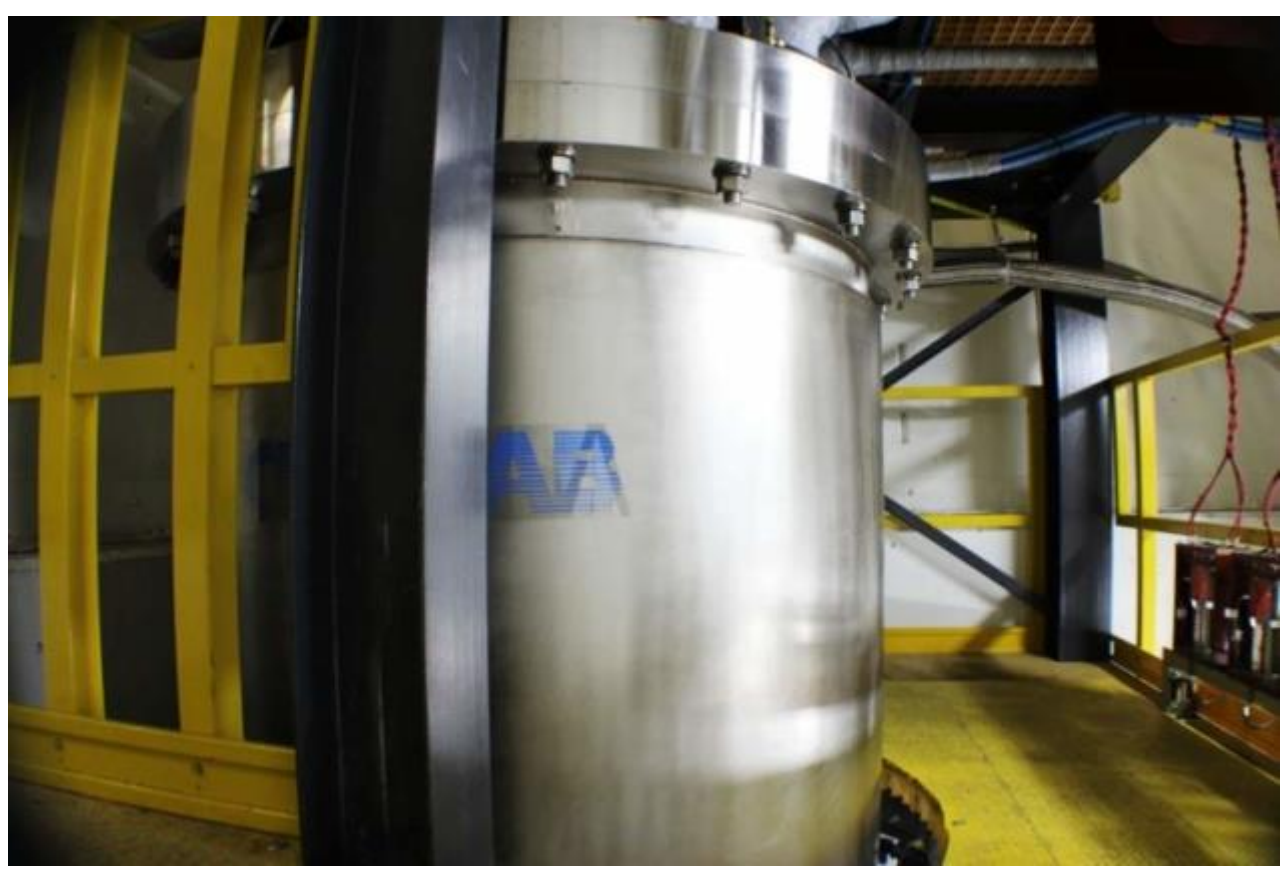
According to Shekhter, the 100 T magnet at Los Alamos National Laboratory in the US was the "real hero" of the work.

In this new research, Shekhter – a co-author of the 2016 study – worked with colleagues in the US, Columbia and Germany to ascertain whether the same "B-linear resistivity" was also seen in cuprates. They tested the resistance of thin films of strontium-doped lathanum cuprate, finding it was linearly proportional to magnetic field across a wide range of temperatures at fields up to 80 teslas – the highest they tested. Shekhter says that these results provide crucial confirmation that strange metals cannot be described by Fermi-liquid theory.