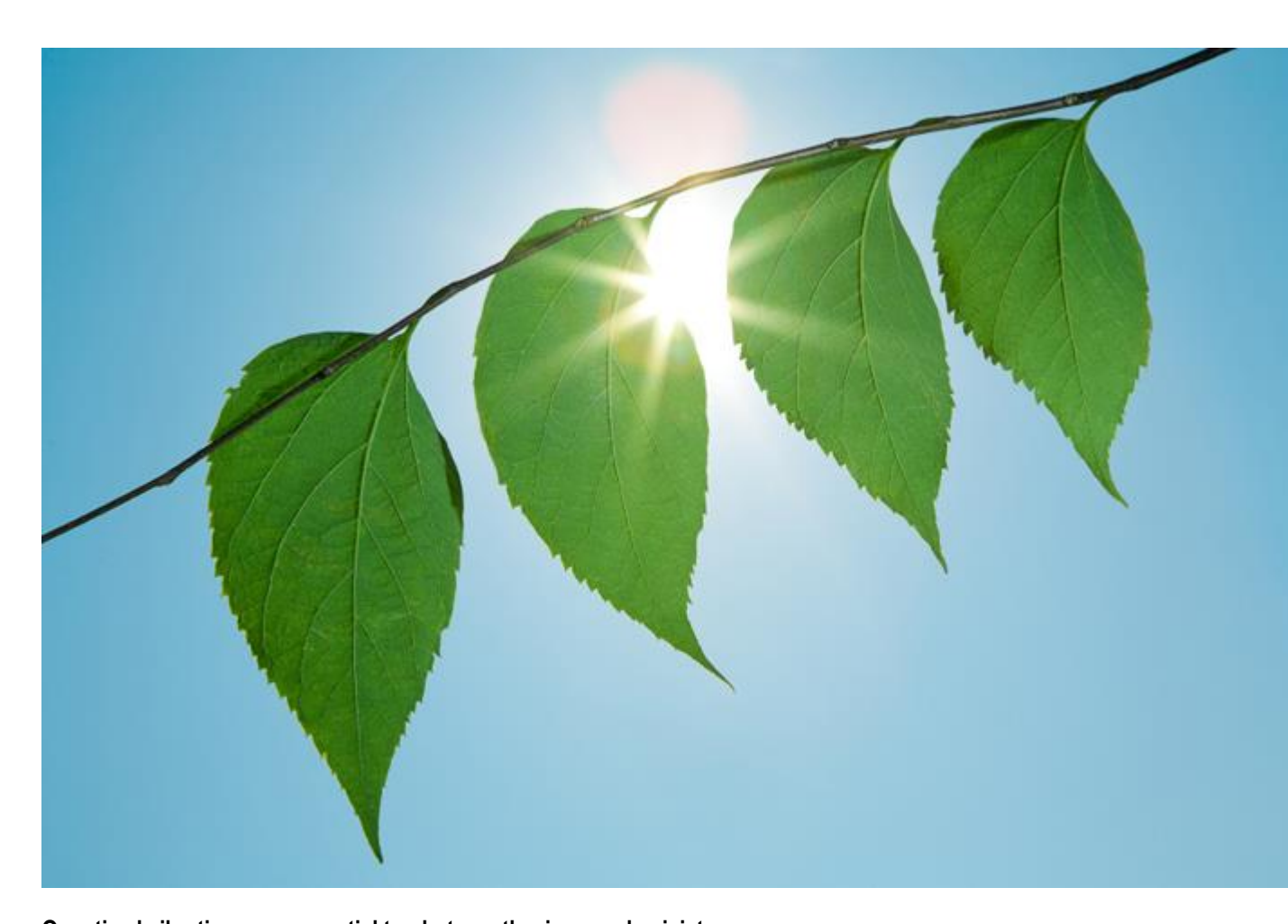
Quantized vibrations are essential to photosynthesis, say physicists

qubit's energy levels amounts to about 0.001 eV, whereas a typical laptop battery stores a few 10^{24} eV. "These devices will not replace normal batteries," he says.