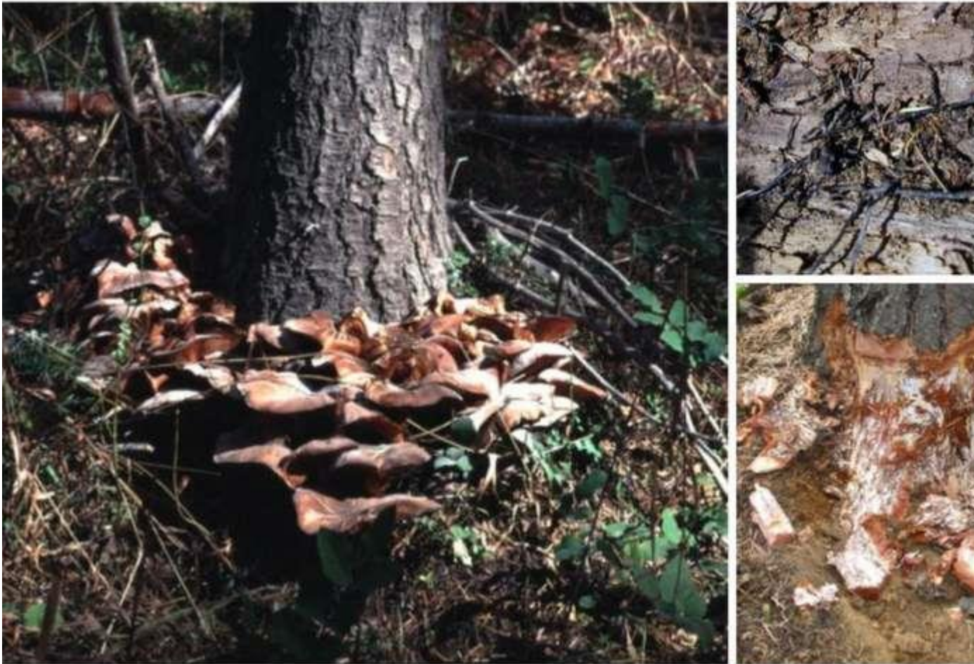
Parts of the Armillaria ostoyae organism include the mushrooms, the black rhizomorphs and the white mycelial felts.

In a keynote at this year's Breakthrough Discuss conference, astrophysicist Martin Rees shared a similar hope, that AI could lead to "intelligence which surpasses humans as much as we intellectually surpass slime mould."