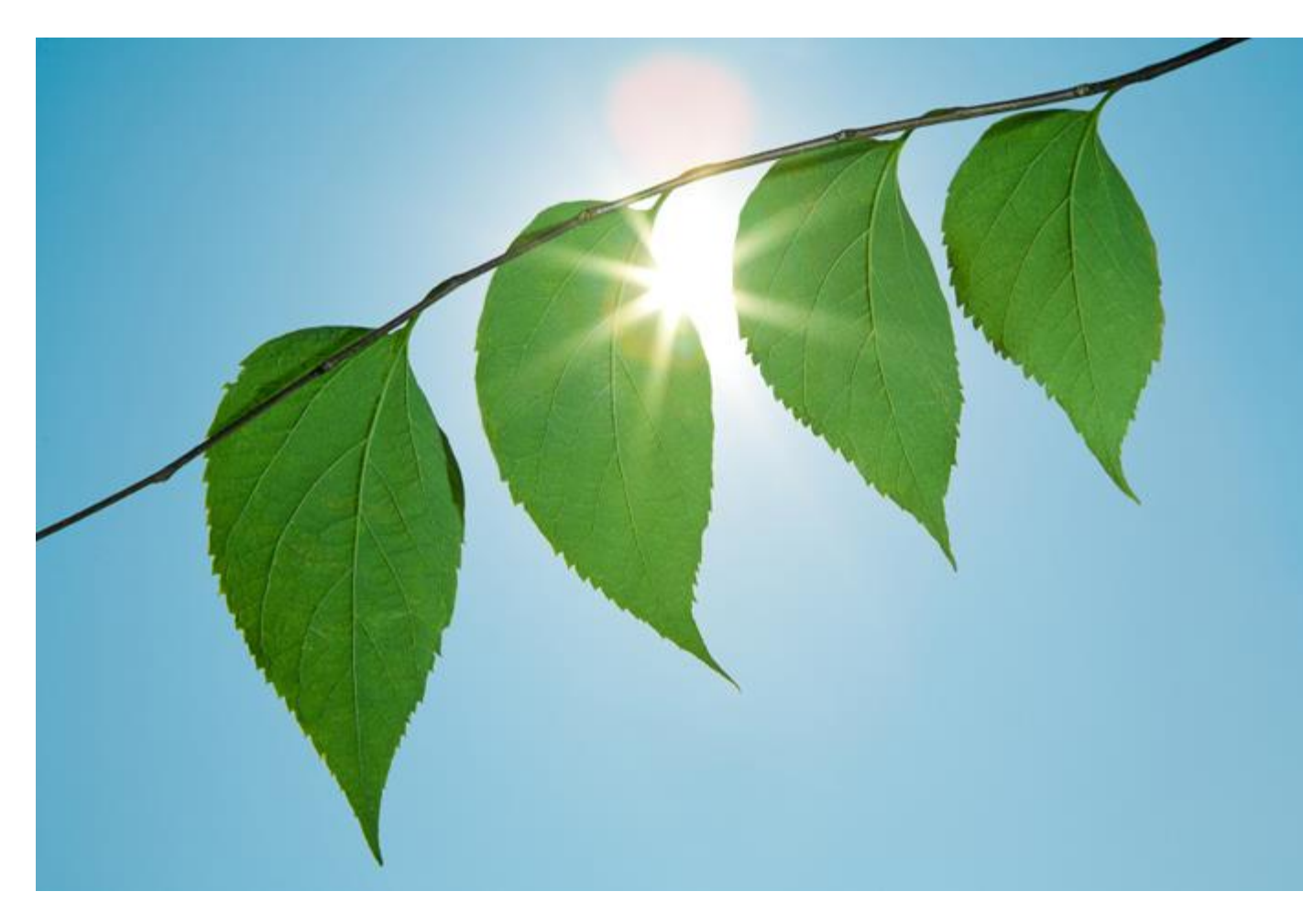
Quantized vibrations are essential to photosynthesis, say physicists