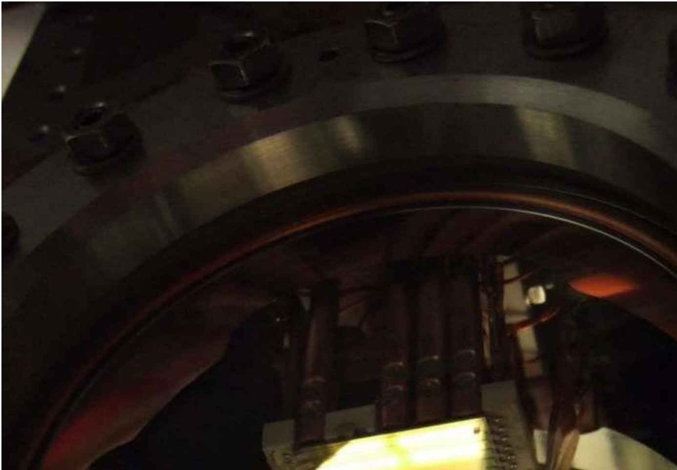
The atom chip, used to control ultra cold atom clouds.