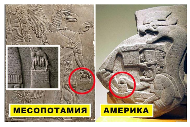
Fig. 3. Images of handbags on ancient rock paintings of Mesopotamia and America

Just as ancient shumer represented the gods in the form of humanoids, ancient Egyptians and various cultures in America did the same. Why the ancient cultures divided by thousands of kilometers represented the gods almost identically? And it, disregarding a mysterious bag. On the archaeological site of La Venta it is possible to find a stone stele with the image of ancient mesoamerican god Kettsalkoatl who for some reason holds same "bag" or "bag" which appears on ancient Sumer images in hand.