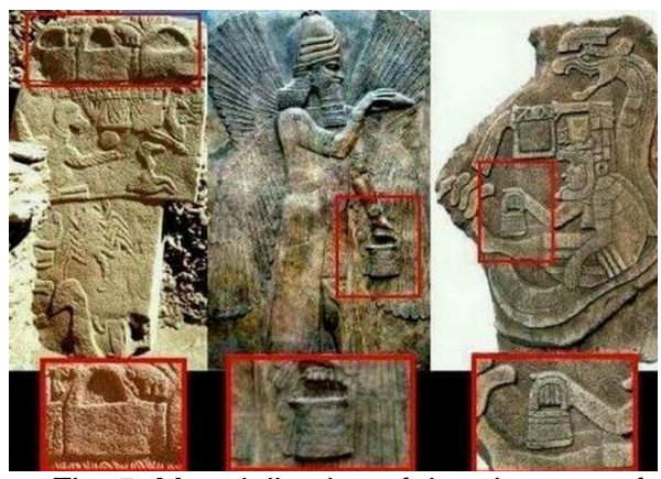
Fig. 5. Materialization of the phantom of animals