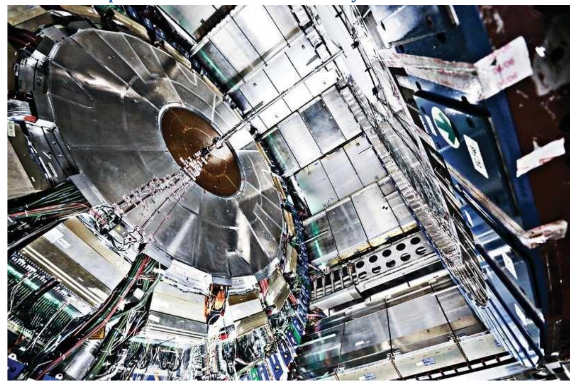
Possible new particle hints that universe may not be left-handed

Mirroring the universe