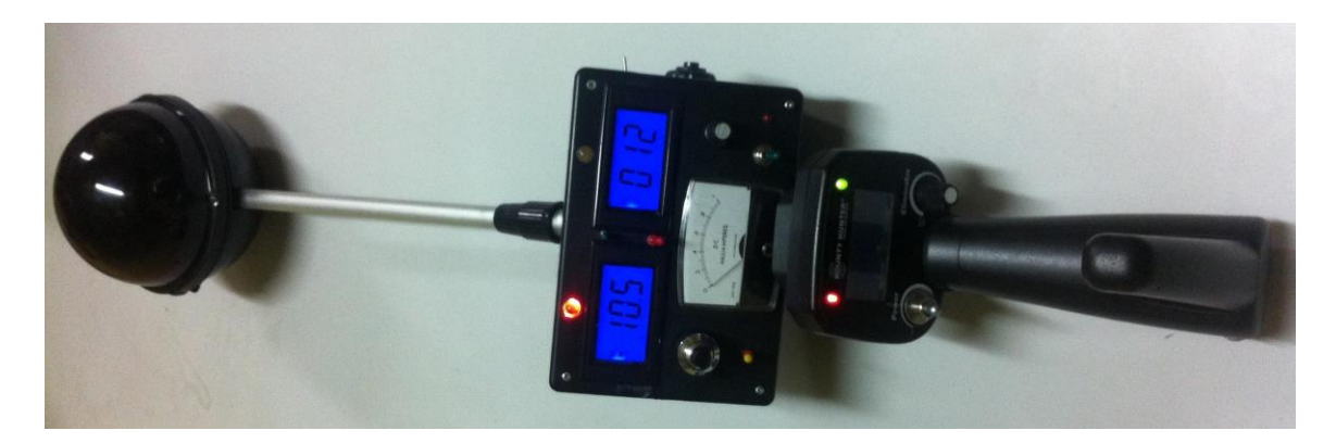
Fig.1. One of the versions of SEVA-instrument

SEVA measures components of the Field Gyroscope: its Quasi-Stationary Spinning, QSS, and Non-Stationary Spinning, NSS.