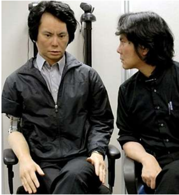
Fig. 3. Japan creator Hiroshi Ishiguro together with his electron copy.

I want to show, that in scientific and technical progress the mankind can hope only on itself. Backward (technically) and even equal civilizations of anything can not give us. More advanced (especially strongly left forward) civilization will be only a signal for us, that our civilization has lost Space Race to the Supreme Mind (Reason) and we are now awaiting enslavement and ultimate disappearance. Really, present, that you have met the certain human primitive tribe living in caves, and they ask you to share knowledge. You explain as arranges a nuclear reactor as it is possible to make the plane, the computer, the TV as by radio it is possible to communicate with places thousands of kilometers distant. You will not be understood, and even if they will believe that such is possible, all this knowledge for them are useless, for using them it is necessary to have the big state with the population in hundreds of millions of active persons, with co-existing powerful industry (i.e., it is necessary TO HAVE this knowledge ALREADY!), It is necessary to train hundreds of thousands of the scientists, engineers, technicians, material workers ( all this i requires accumulation of hundreds years of learning and huge physical and material means). In best case, you can train them in producing of the bow and spear with bone tips. But how to do it, most likely, they already have guessed and make better weapons without your help.