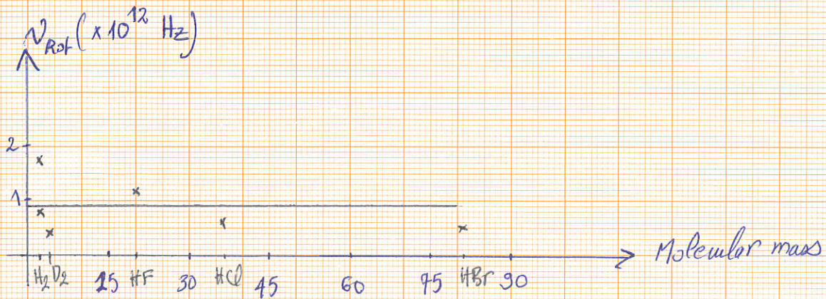
Fig 02: Rotational frequency as a function of molecular mass

from Fowler & Guggenheim, Statistical Thermodynamics , 1939