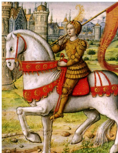
Figure 1. Joan of Arc illustration from 1505 manuscript. Figure adapted from [1].

Scripture is full of God’s intervention, a wonderous example is (Josh. 6:1-5); “ the LORD said unto Joshua ... I have given into thine hand Jericho ... compass the city, all ye men of war, and go round about the city once. Thus shalt thou do six days ... seven priests shall bear before the ark seven trumpets of rams' horns: and the seventh day ye shall compass the city seven times, and the priests shall ... make a long blast with the ram's horn, and when ye hear the sound ... the people shall shout with a great shout; and the wall of the city shall fall down flat ”.