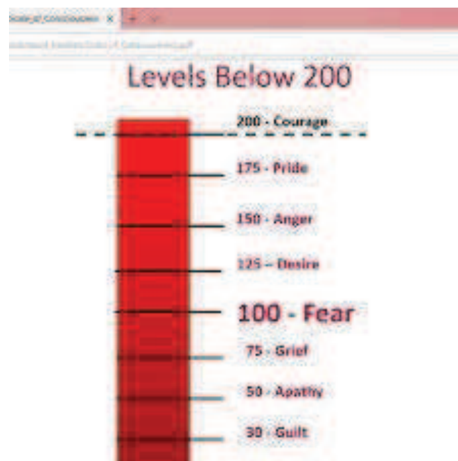
Illustration 1. (Below 200) Scale of Consciousness according to Prof. David Hawkins

The core of the theory of the scale of consciousness is roughly as follows: that human consciousness continues to develop and process, if it is still below 200, then someone will still be controlled by hate, jealousy, shame, worry, fear, etc. However, if a person moves to a scale of consciousness above 200, then he will begin to recognize courage, peace, joy, and so on. Then if you reach level 500 and above, you will practice love, and when you are above 700 you will experience enlightenment.