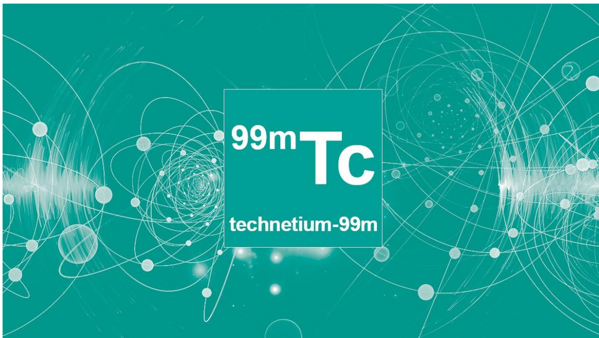
Battle of the elements: technetium-99m diagnoses disease then decays away

The companies have also performed a 132-hr test run on the neutron generator, which demonstrated more than 99% uptime. These successful tests validate the performance and reliability of the Phoenix neutron generator technology and confirm its status as a "steady-state system" than can operate at high output for long stretches of time. This sets it apart from other high output fusion systems, which have only operated in a pulsed mode over short durations.