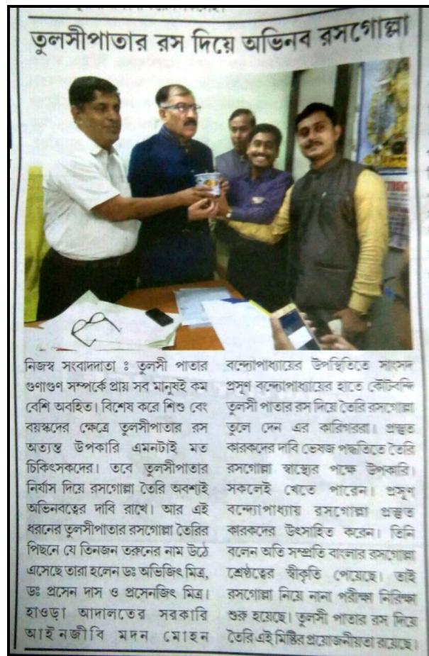
Figure 4: Media coverage of Tulsi Rasgulla.