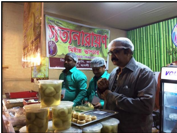
Figure 3: Marketing of herbal dessert in festival. Source: (Mitra, 2018) [13].