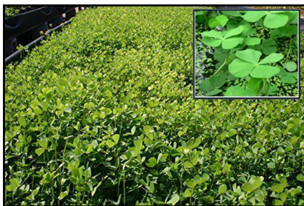
Figure 1: Morphology of Marsilea quadrifolia .

The carbohydrates concentration was measured by Anthrone method [5]. Hundred milligrams (100 mg) of plant sample was weighed and taken into a boiling tube, hydrolysed by keeping it in a boiling water bath for three hours with 5 ml of 2.5 N HCl and the mixture was cooled at room temperature. Using sodium carbonate it was neutralized and the volume was made up to 100 ml. Then it was centrifuged and supernatant was collected. 0.5 ml of aliquots was used for estimation. The working standards were prepared by taking 0, 0.2, 0.4, 0.6, 0.8 and 1 ml of the working standard glucose solutions and '0' served as blank. 0.1 and 0.2 ml of the test sample solution was taken in two separate test tubes. In all the test tubes, the volume was marked up into 1 ml with water and blank was set with 1 ml of water. 4 ml of anthrone reagent was added to each tube, mixed well and kept it in water bath for 10 minutes. The contents were cooled rapidly and the absorbances were read at 630 nm and the amount of total carbohydrate present in the sample was calculated.