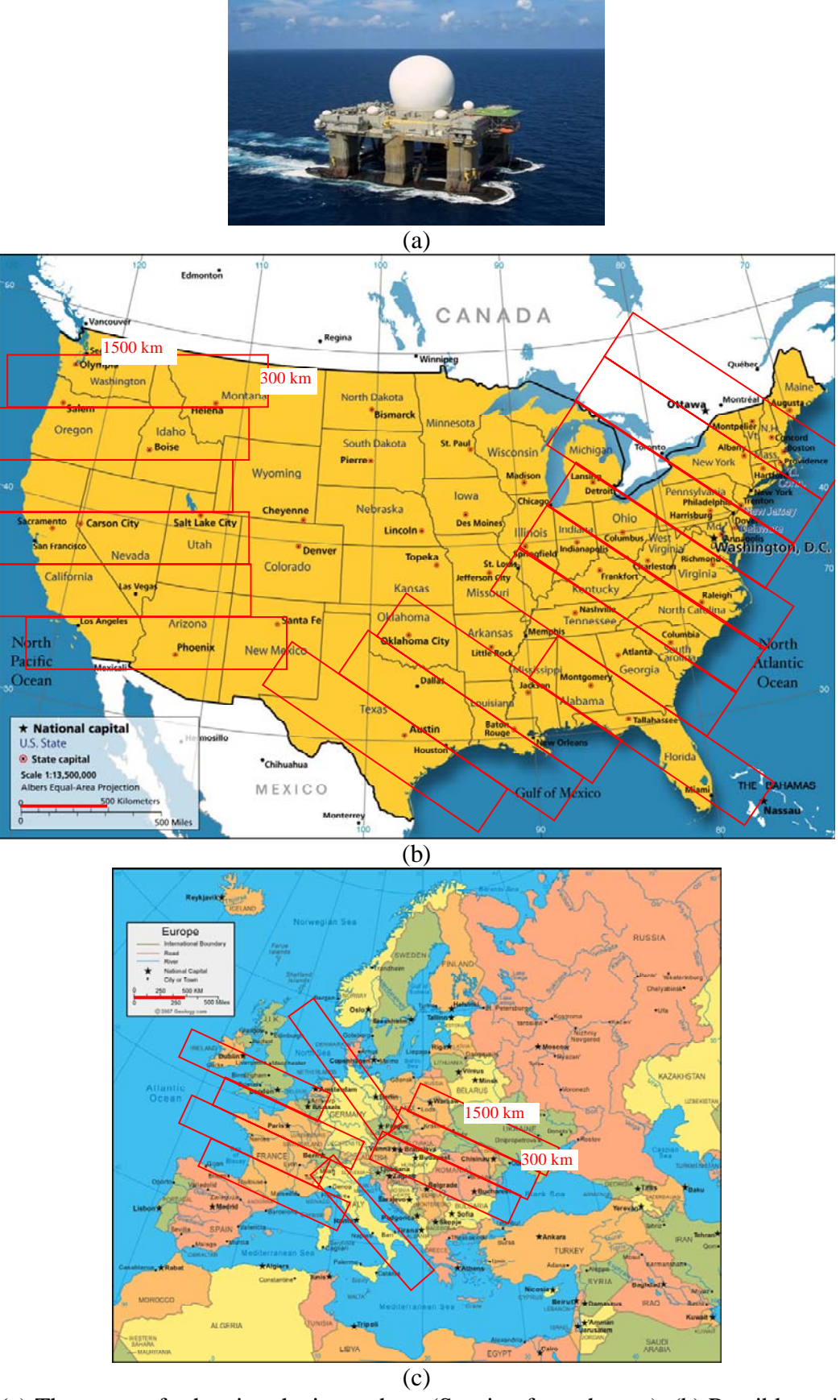
Fig. 2 - (a) The system for heating the ionosphere (Starting from the sea). (b) Possible region to be depressurized in an attack to USA. (c) Possible region to be depressurized in an attack to Europe.